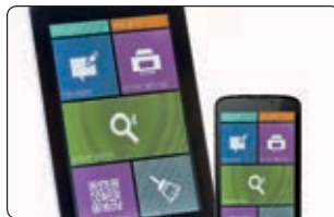
App works on Android or iOS devices