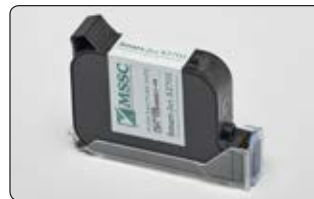
HP TIJ 2.5 technology