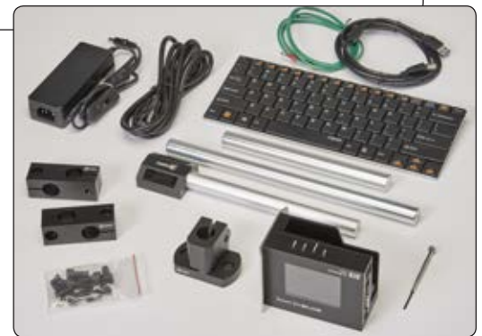
Pieces included in package