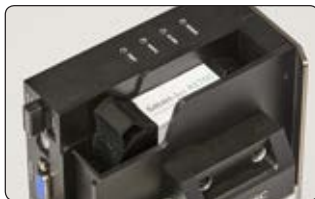
Redesigned Printer Head