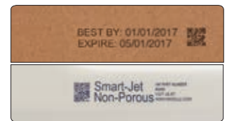
Porous and non-porous print