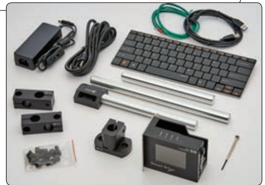
Pieces included in package