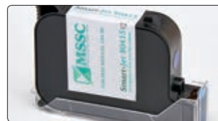
HP TIJ 2.5 technology