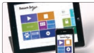
App works on Android or iOS devices